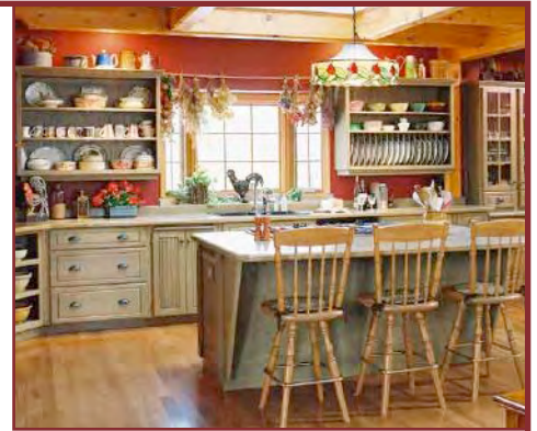
Kitchen with timber ceiling